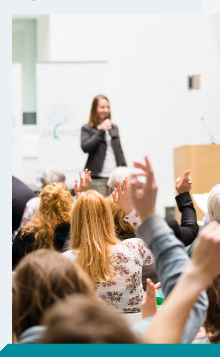
November 30-December 2 Lexington, Kentucky