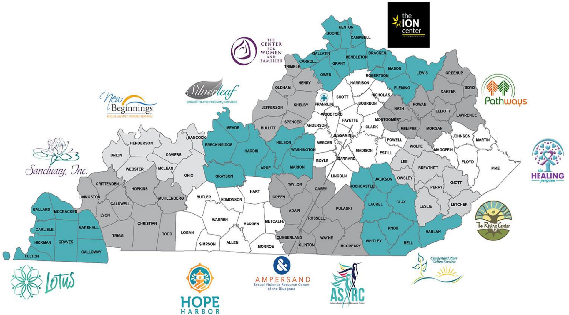
RCC Map updated 2023